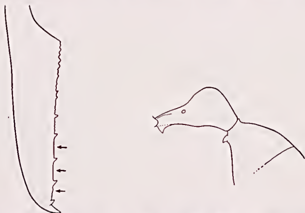
Fig. 2.—(Left) Drawing of the right jaw of Nothomyrmecia macrops , much enlarged, showing teeth. The arrows indicate parts of the border that were seen to be very finely serrate at higher magnifications. (Right) Detail of the petiole or "waist" of N. macrops and its attachment to the gaster. These drawings were made by E. O. Wilson in 1955 from one of the two original specimens.

The two Nothomyrmecia workers were collected by a small excursion party journeying in the isolated mallee and heath country south of Balladonia, during the period December 7, 1931, to January 7, 1932. A general collection of insects was made by several persons in the party, and this was later turned over to Mrs A. E. Crocker (néé Baesjou), of Balladonia Station, an amateur entomologist. Unfortunately, no specific locality records were kept,